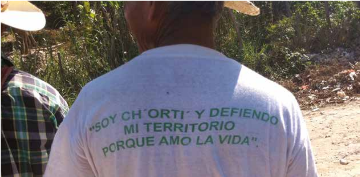
Member of Nuevo Día. The T-Shirt reads "I am Ch'orti' and I defend my territory because I love life"