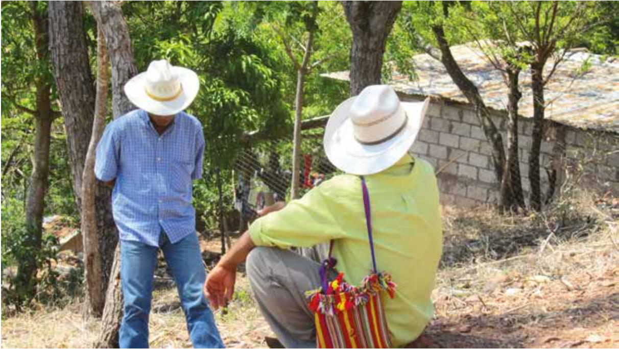
Community members from the Indigenous Ch'orti' community of Las Flores, Jocotán