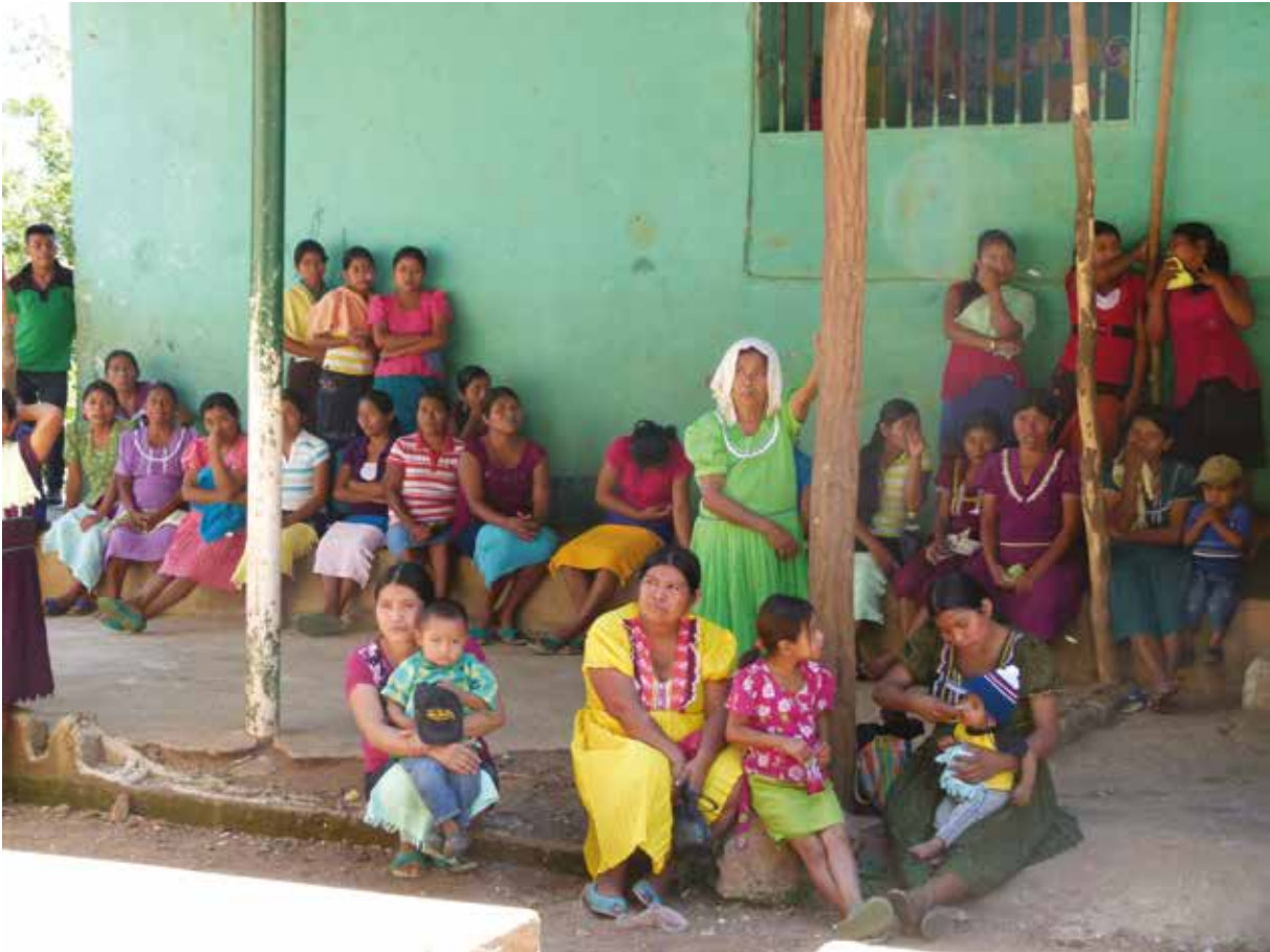
They are communities with their own language, and a sense of ancestral land rights and Ch'orti' organisation, in the Maya tradition. They self identify as indigenous people.