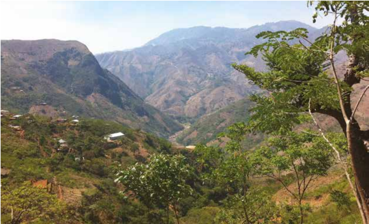
The view of the valley where a hydroelectric project is planned

“What is the Jupilingo river? It’s a miracle to see the river because for the last three years we have lost our harvest from drought. It’s a miracle. It is our only natural resource, our source of life. Our lives depend on it”