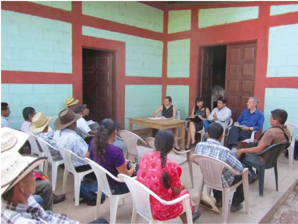
The expert delegation meeting with Ch'orti' community members

The fact-finding team acted pro bono and without remuneration.