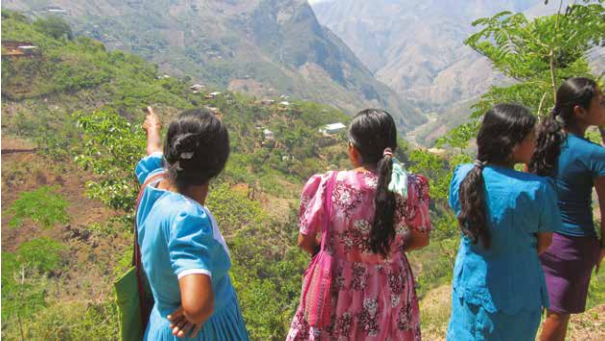
Indigenous Ch'orti' community members indicating the areas that may be affected by the hydroelectric project in Jocotán