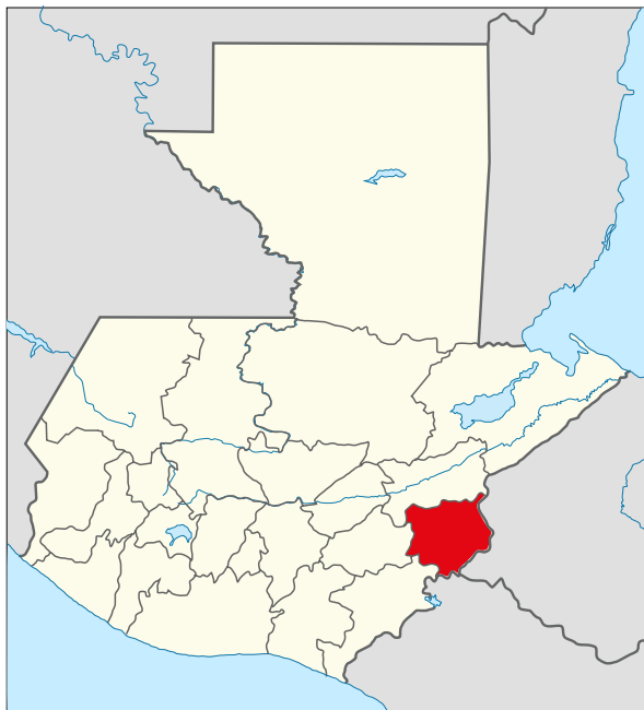
Map of Guatemala showing Chiquimula region in red