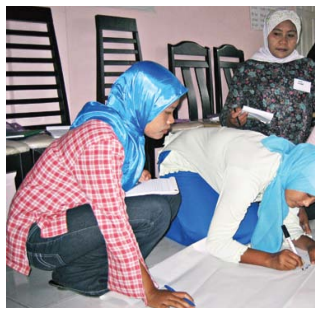
Workshop for women with partner FORPWAT (Forum for Women's empowerment Central Aceh)

PBI's work in Aceh was curtailed as the political situation deteriorated and the government declared martial law in May 2003. PBI teams re-located to the neighbouring province of Medan where they monitored the situation by telephone and met with human rights defenders whenever they were able to travel outside Aceh. PBI also conducted conflict transformation workshops at the request of local