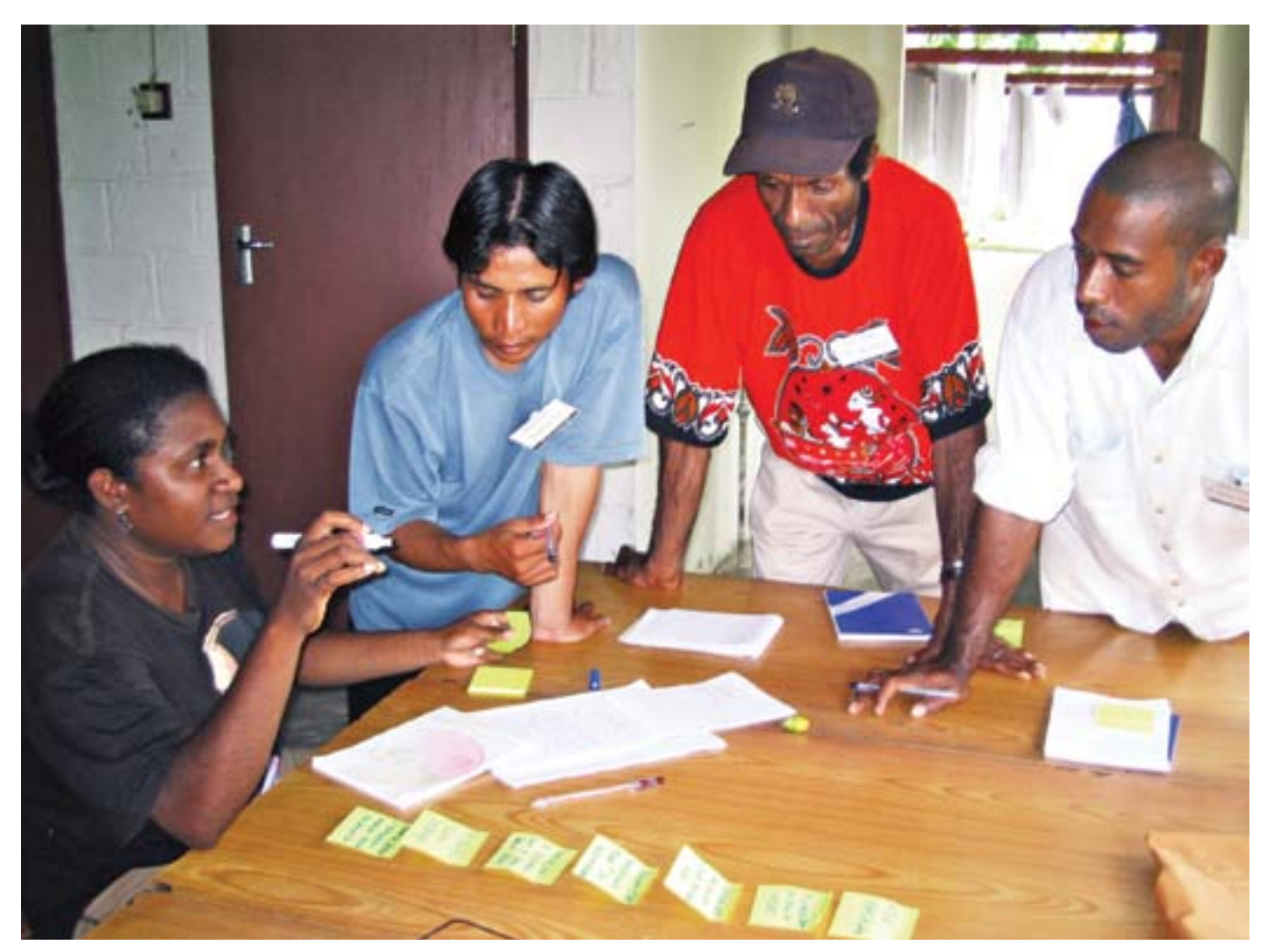
PBI peace education workshop in Sentani, Papua 2005

PBI was able to respond to these, emphasising protective services or participatory peace education as appropriate. In Flores and elsewhere, conflict transformation and prevention workshops played an important role, given the number of inter-group conflicts (ethnic and religious) that flared following the fall of Suharto.