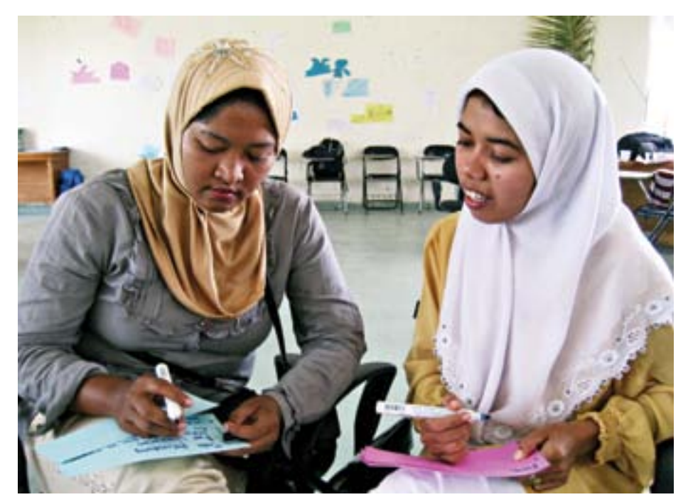
PBI peace education summit in Aceh, 2008

Monthly discussions in which participants proposed a theme and local organisations and members of civil society were invited to participate. The facilitated discussions, which would sometimes include a local guest speaker, proved to be empowering and community building, as they provided a safe space to talk about civil society issues and initiatives. Themes suggested by participants included inter-group conflict and traditional methods of conflict resolution, women's empowerment, regional development and its impact on the environment.