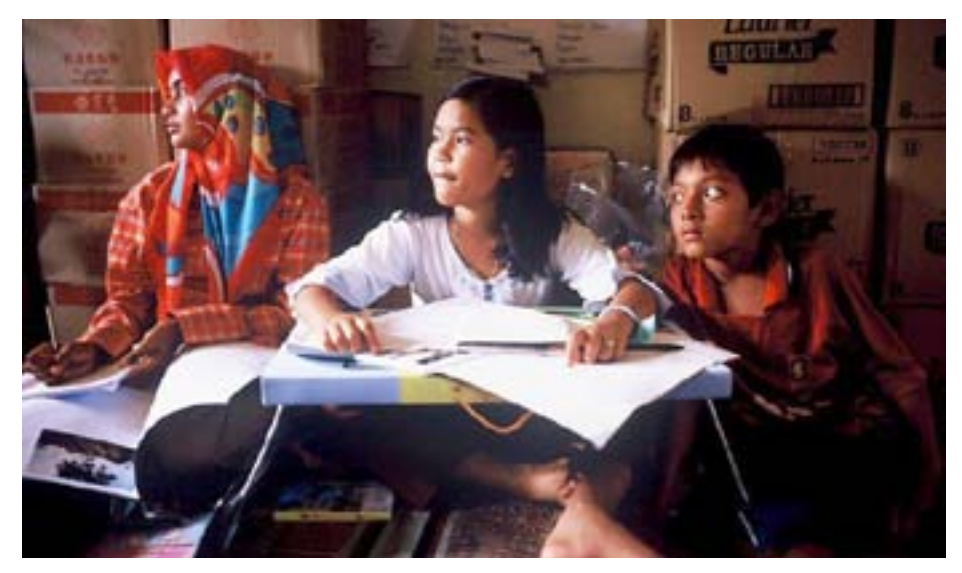
Workshop with partner CMC (Children's Media Centre) in Aceh, 2006

organisations in Medan during this period.