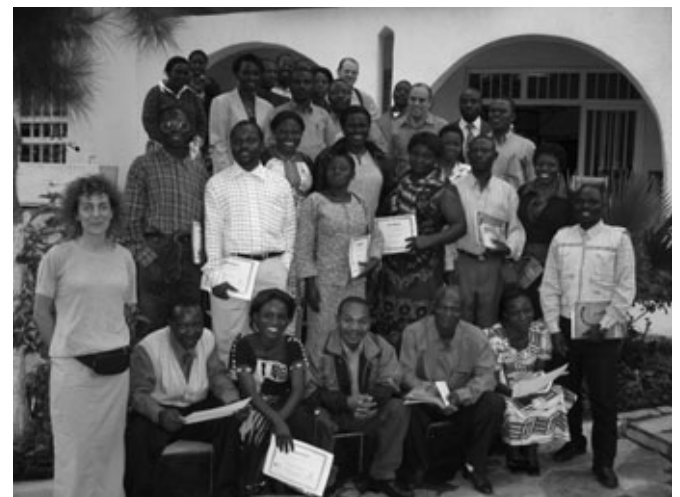
Security training workshop in the Democratic Republic of Congo