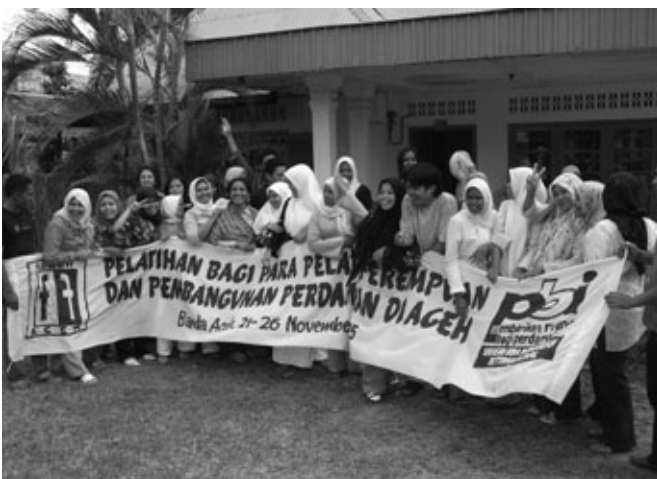
27 Flower Aceh counselors and community organisers attended a workshop to establish local trainers skilled in peace-building, gender issues, and nonviolent conflict transformation who could apply these skills within their communities.

19 volunteers in Jakarta, Aceh, and Wamena and Jayapura, Papua, four paid staff in Indonesia and one in Canada, 26 volunteers on the Project Committee and subcommittees.