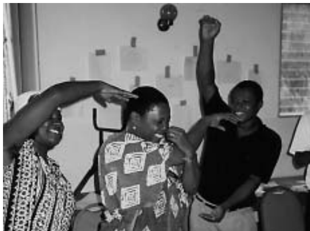
Training for non-violence trainers in a PBI peace education workshop in Haiti.

By sharing knowledge and experiences, people can overcome fear and discover new self-confidence and dignity. They can also work on communication skills, and develop new methods of conflict resolution such as analysis, dialogue, mediation, negotiation and reconciliation. The kinds of people who attend these workshops include community leaders, social workers, members of grass roots organisations and individuals interested in non-violent social change.