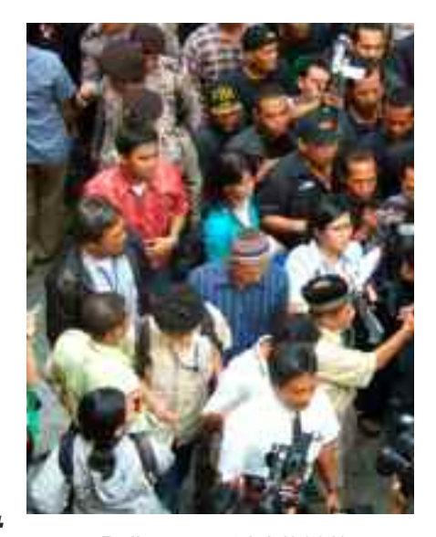
Pollycarpus trial (2008)

judges convened in the courtroom and passed sentence. The verdict was that of not guilty.