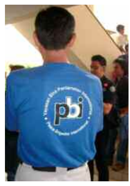
PBI volunteer monitoring the Muchdi trial (2008)

In the meantime Suciwati will continue advocating for her late husband, raising the profile of the Munir case in an effort to exert political pressure on the judicial system of Indonesia. In February of 2010 Suciwati will be attending a human rights conference in Ireland.