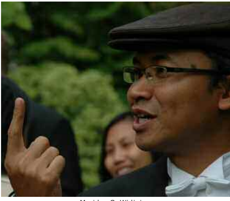
Muridan S. Widjojo

1. Advocate and promote dialogue as a viable tool for conflict resolution at the level of central government, especially focusing upon the Presidential and Ministerial levels.