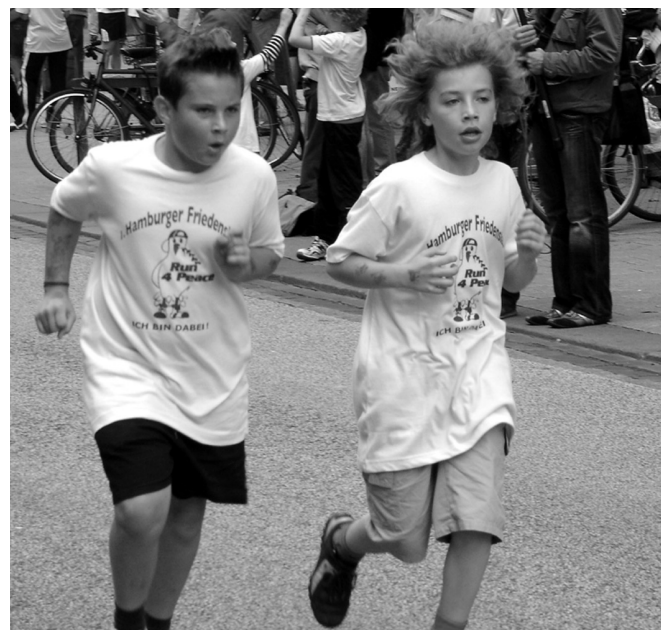
Two of the 1,700 participants in a sponsored 'Run for Peace' organised by PBI Germany and the German Civilian Peace Service for children between the ages of 4 to 11. The Dalai Lama launched the event, which raised over 30,000 euros.

PBI Netherlands and two other NGOs gave a presentation in the Dutch Parliament on Civilian Peace Work. This was part of a wider effort to lobby for the creation of a National Plan for Peace Building, similar to the one in Germany.