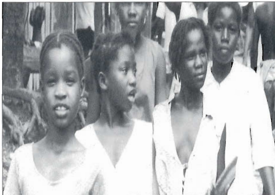
Young women in a displaced community, Urabá

An essential part of an effective protective accompaniment strategy is maintaining a high level of visibility locally, nationally and internationally. During the year the team had over 500 meetings with Colombian government officials, middle and high-ranking officers of the armed forces, and state institutions. The purpose of these meetings was to