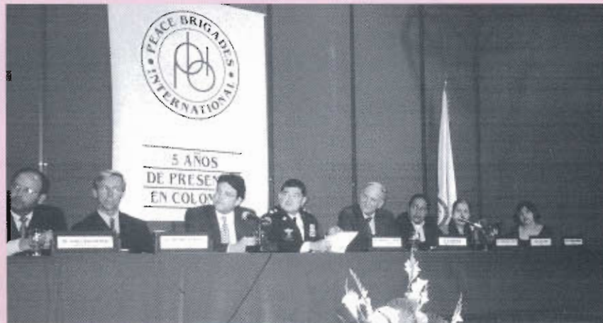
Celebration of the fifth anniversary of the Colombia Project, Bogotá

Dr Gustavo Bell Lemus, Vice-President of Colombia.