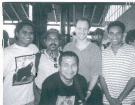
PBI volunteer meets East Timorese human rights defenders

The arrival of an Exploratory Team in Jakarta and East Timor coincided with outbreaks of militia violence, but the Team met with the inviting organisations, and a wide range of other groups who responded positively to the proposal to open a PBI project. The PBI International Council approved the opening of the Project in July. However, the setting up of an office in Aotearoa/New Zealand, and preparations of a team to work in East Timor coincided with an upsurge of violence perpetrated by the Indonesian military and the militia. The Project kept in touch with developments through the participation of two committee members in the International