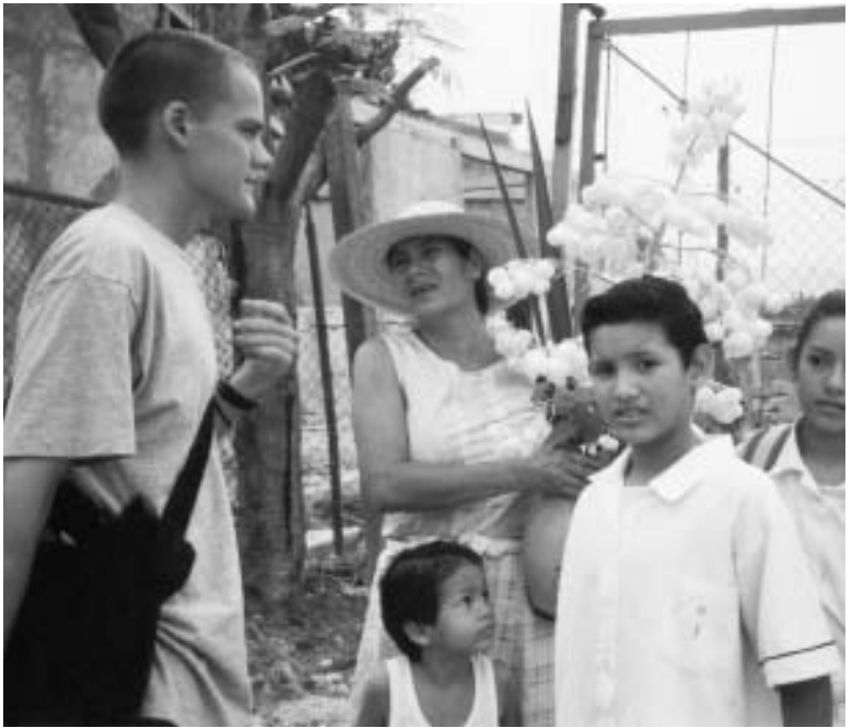
PBI accompanies a family from the Colonia Alcaine, Acapulco who have been subjected to harassment because of their struggle for land rights.

two teams of six volunteers in Mexico City and Chilpancingo (Guerrero) provided 769 days of accompaniment and held