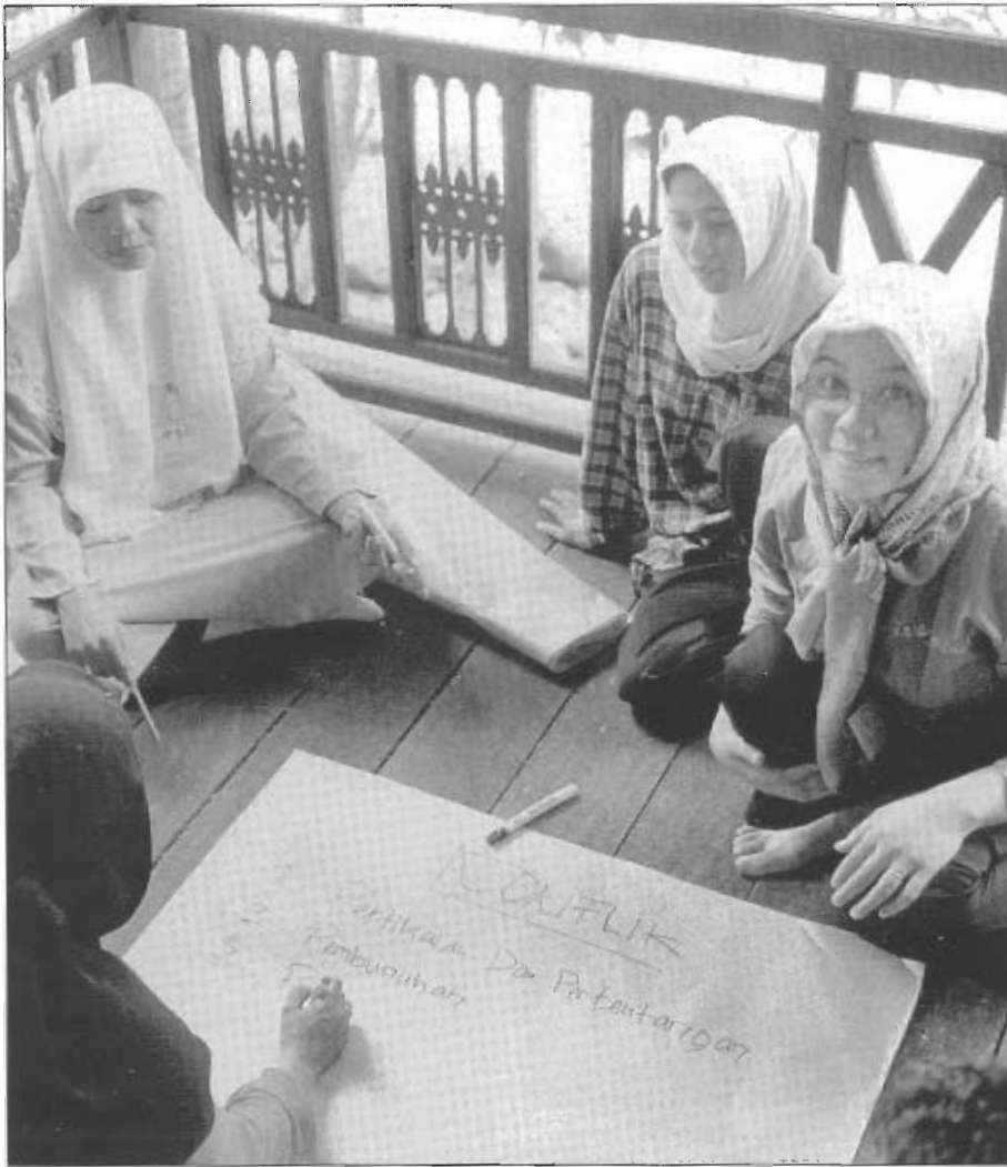
Brainstorming responses to the word 'conflict' at a conflict transformation workshop organised by PBI and Flower Aceh.