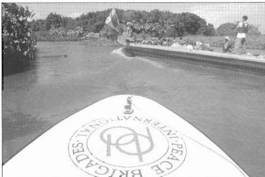
PBI accompanies members of the displaced community of Cacarica as they return home

200 meetings were held with government officials and the security forces at local and national levels. We conveyed to the authorities the concerns of the international community about human rights abuses and ensured that they put pressure on potential violators.