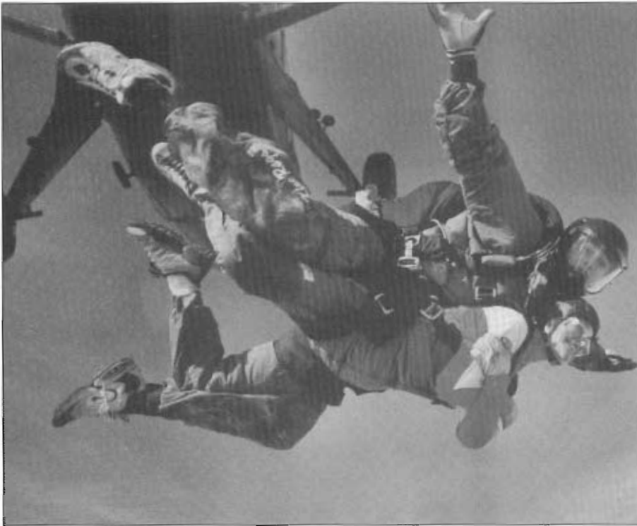
Twelve people from PBI UK parachute out of a plane, raising $3,000 in sponsorship to support the work of PBI.