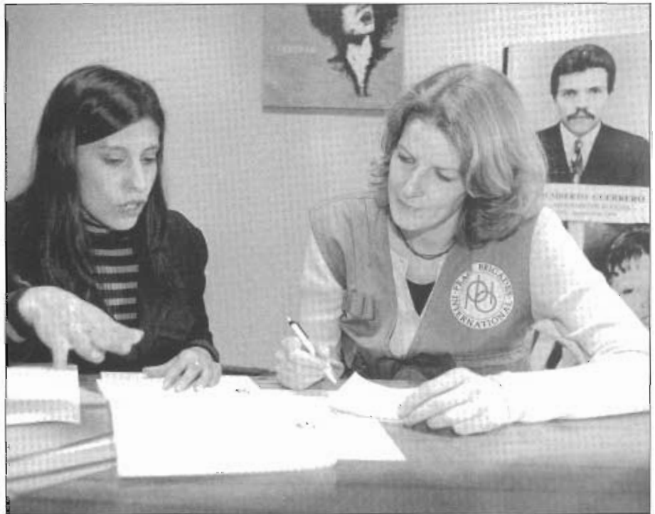
PBI volunteer with a member of ASFADDES (Association of the Families of the Detained and Disappeared), Bogotá, Colombia

Flores, Indonesia: A PBI trainer and an Indonesian co-facilitator, start a four day conflict resolution training for 25 local activists to explore local methods of mediating